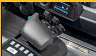
Fingertip Control (Standard)

Depending on operator preference, each of these hydraulic controls is available to help maximize productivity.