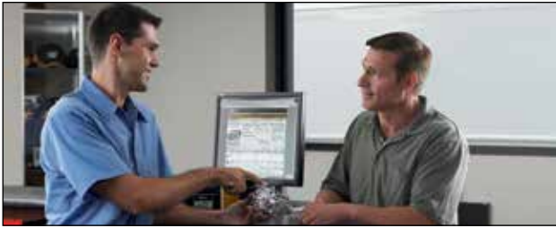
Local service and support