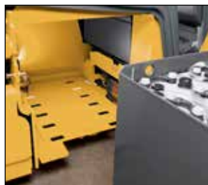
Snap-Fit battery extraction