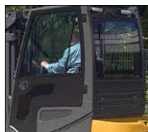
Raised operator cab (for special applications)