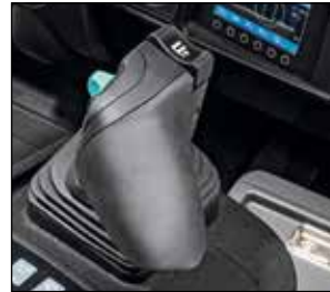
Joystick unitized control