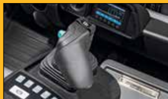
Joystick Control (Optional)