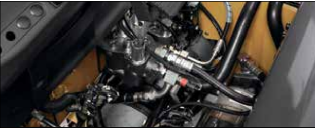
Factory warranty for added protection