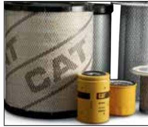
Genuine OEM parts