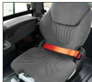
Advanced ergo seat

Additional options are also available to further customize the lift truck for your business.