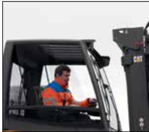
Comfort (closed) cabin