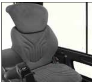
15° swivel seat

Better distributes floor loading weight on unpaved surfaces when carrying a load.