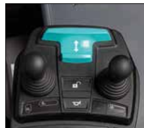
Mini-lever hydraulic control