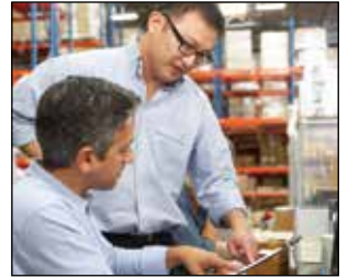
Custom financing packages