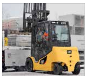
Cold storage / Tropics modification