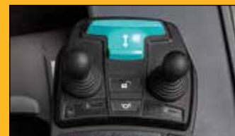
Mini-Lever Control (Optional)